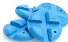
Rubber Tool for cable support, item no. 98028785