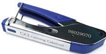
CX3 Pocket Tool 59/6 compression tool item no. 98029070