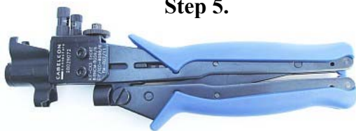
CX3 All Size compression tool item no. 98029072